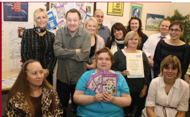
Mersey Care NHS Trust's 'Standing up for human rights group'