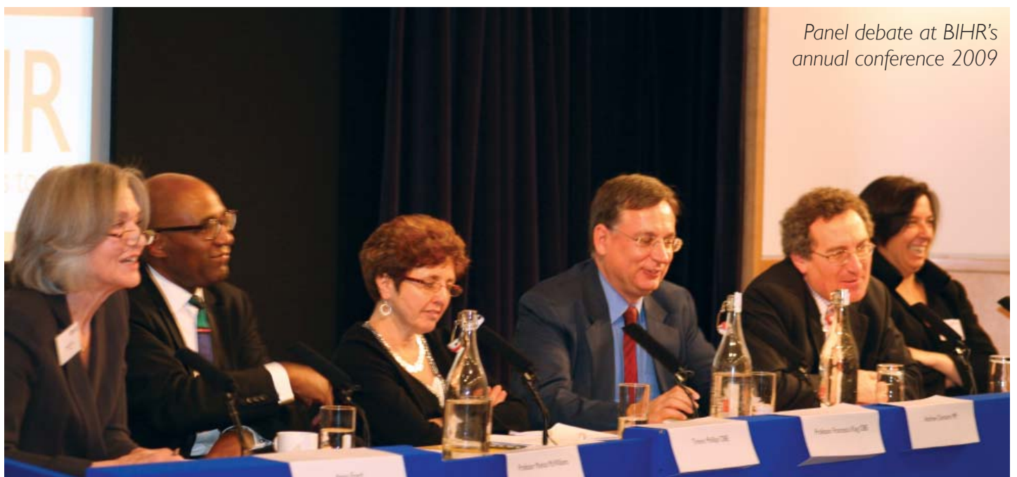
Panel debate at BIHR's annual conference 2009