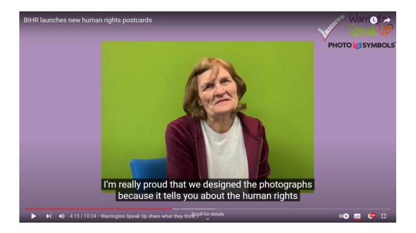
Click here to watch the launch video.

BIHR created a video to share at the launch event, explaining this project and where the idea for the postcards came from, and giving the staff and advocates from Warrington Speak Up and the actors from Photosymbols an opportunity to speak about their involvement in developing the resource.